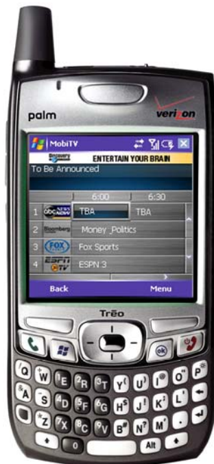
Figure A: The MobiTV mobile information guide let you view what is currently on and what's coming up.