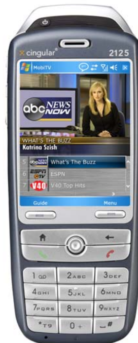
Figure C: Users can watch MobiTV in full screen mode on both Pocket PCs and Smartphones